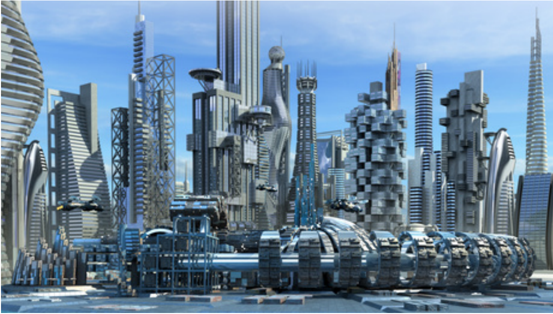
Science fiction city skyline

On a separate sheet of paper, write a story using this photograph prompt. Use the Word Box for ideas. Illustrate your story.