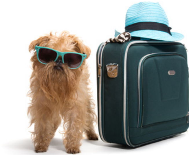
Dog with luggage