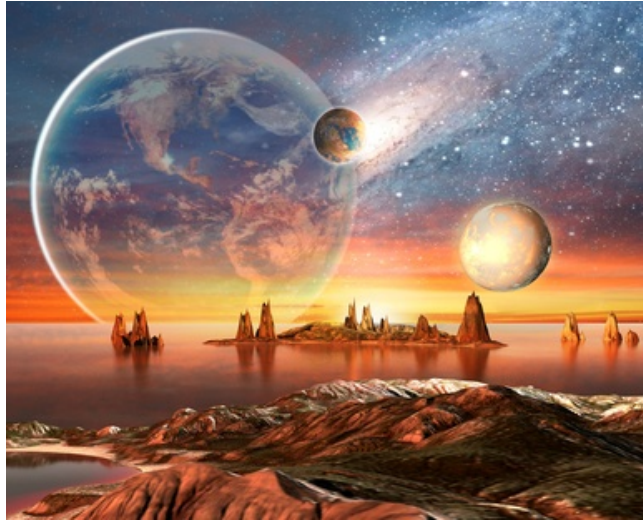
Alien Planet